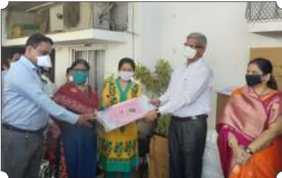
NCP Cell distributed faceshields